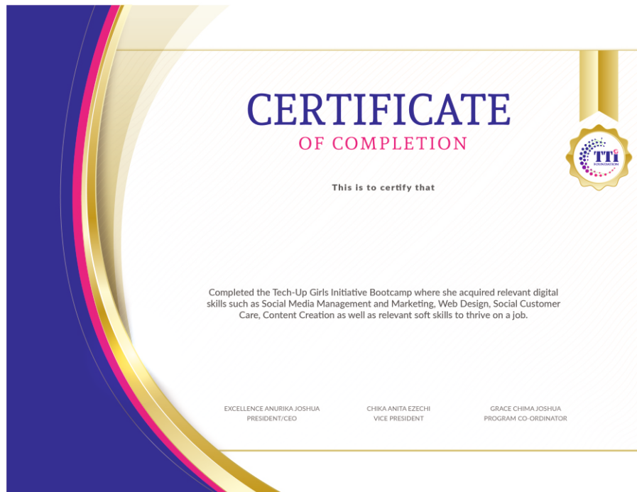
Certificate of Completion