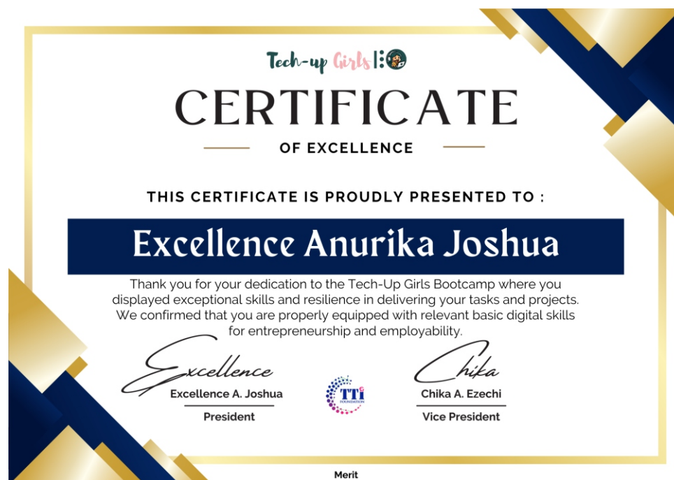
Certificate of Appreciation